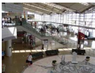
Arrival at Niigata Airport

No pick-up service is any more provided either at the Niigata airport or at the Niigata train station because the total number of exchange students of various kinds far exceeds the capacity of Niigata University. Instead, more specific information of how to come to Niigata University or to the hotel will be provided. Because Niigata Airport is small, there will be no problem with the arrival at and departure from there. For those arriving at Narita or Haneda which are big, Niigata University will give them more intensive information.