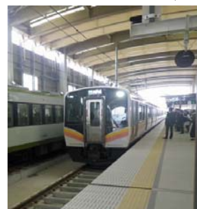
Train to Niigata University Highly energy-efficient new model E129 (Seats are comfortable. Its rest room accommodates wheel chairs. This model gives recorded English announcements to help those who do not understand Japanese. The train station for Niigata University is "Niigata Daigaku Mae" after "Terao" on Echigo Line.)

A big project to elevate all the tracks of the 60-year old Niigata train station is going on. Because the tracks (nos. 2-5) for Echigo Line trains