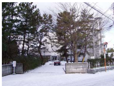
(The dormitory in winter)

Because its capacity is not sufficient, many students live in apartments in the private sector, which Niigata University rents for students and for which students pay the amount of rent comparable to the rent for the dormitory. Information of the dormitory and apartments (mostly in Japanese with some English. Click pdf symbols to see Japanese and English descriptions.).