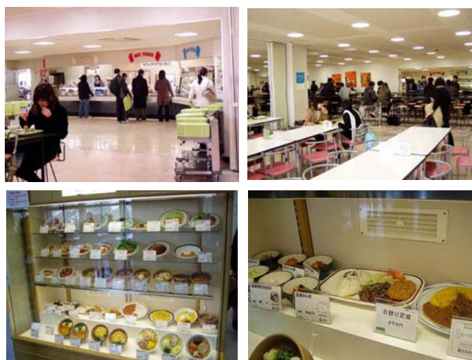
A cafeteria in the University campus

Because its capacity is not sufficient, many students live in apartments in the private sector, which Niigata University rents for students and for which students pay the amount of rent comparable to the rent for the dormitory. Information of the dormitory and apartments (mostly in Japanese with some English. Click pdf symbols to see Japanese and English descriptions.).