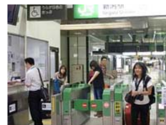
Arrival at Niigata train station (West exit - a smaller exit)