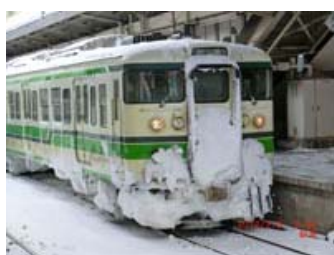
Train to Niigata University (115 model) in winter in snow (This 50-year old historical model with six color patterns in Niigata is being replaced by a newly manufactured E129 model since December 2014.)